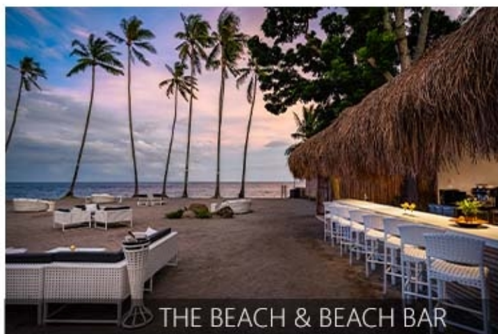
THE BEACH & BEACH BAR