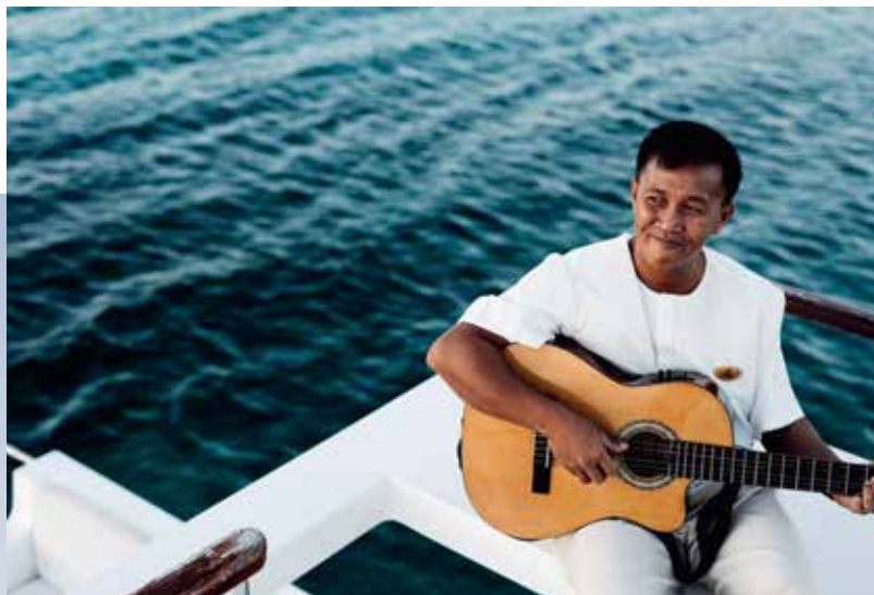
(Clockwise from left) Make a couple of hours disappear on Amanpulo resort's beach; be serenaded on a sunset cruise; enjoy a tropical fruit platter in your casita on arrival