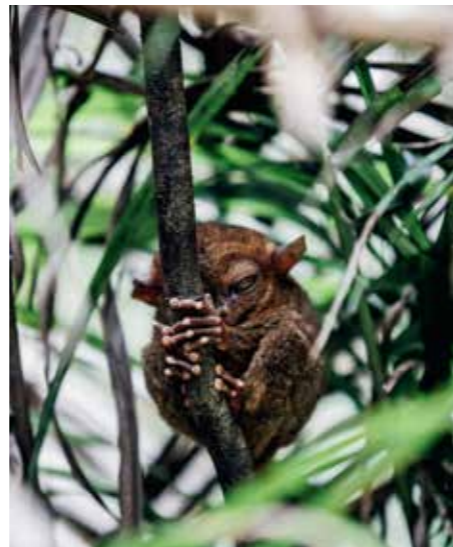
(Clockwise from top left) Try the local beer with lunch in a floating restaurant on the Loboc River; visit the tarsier sanctuary; marvel at the surreal Chocolate Hills