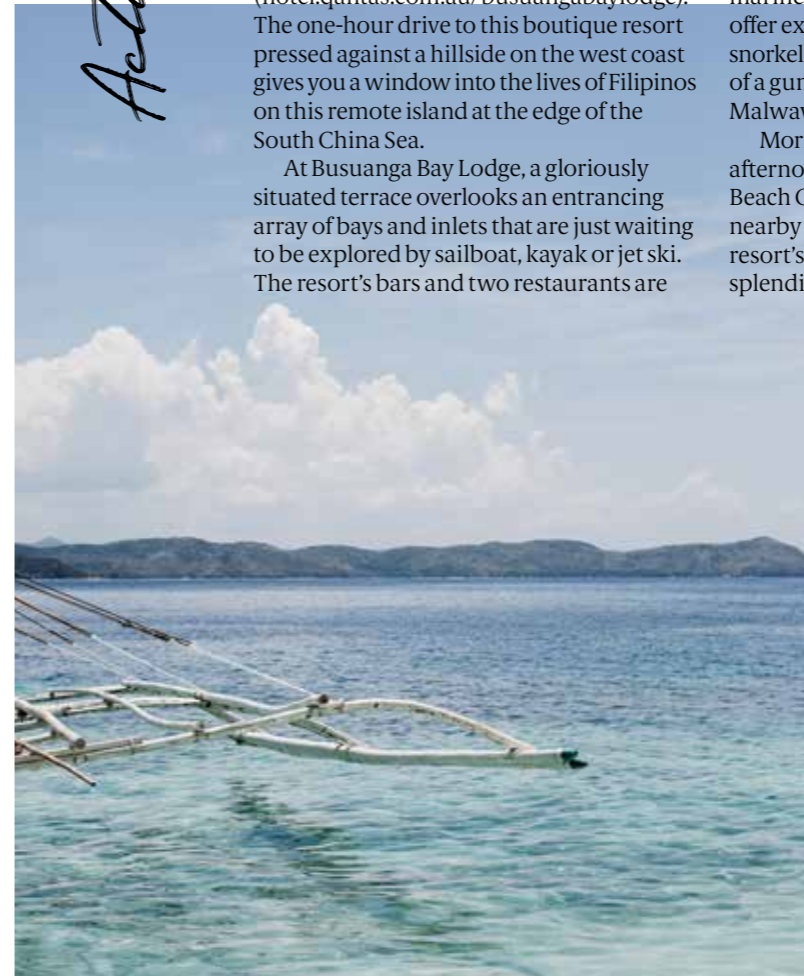
(Clockwise from above) South Cay Beach Club at Busuanga Bay Lodge specialises in water views and cocktails; a local boatman; Coron Island's Twin Lagoon