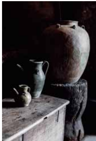
(Clockwise from left) Shangri-La's Mactan Resort & Spa has several restaurants and bars, manicured gardens and a marine sanctuary off the beach; artefacts in Yap-Sandiego Ancestral House in Cebu City